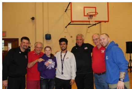
ABOVE: Members of the Hoop Historians and the LeGore Boys and Girls Club of Indianapolis visit during Final Four Week.

The Hoop Historians lived up to their mission statement of being committed to promoting goodwill through basketball, by making a couple of donations during Final Four Week. The group held a Coaches Clinic and made a donation of four Wilson basketballs, with the Hoop Historians logo, to the LeGore Boys and Girls Club of Indianapolis . The Hoop Historians also visited that club the last time the Final Four was in Indianapolis, in 2010. The Historians also “passed the hat” to collect money for The V Foundation for Cancer Research. Through its efforts over the weekend, the Hoop Historians collected $400 for that group.