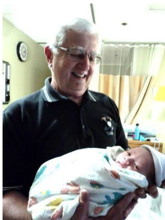
ABOVE: Just call him Grandpa