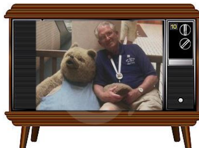
A picture may be worth a thousand words but some things can leave you speechless.