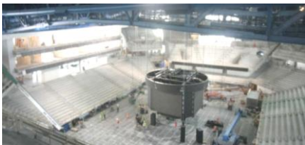
ABOVE: The new arena's construction starts to look ready to host basketball