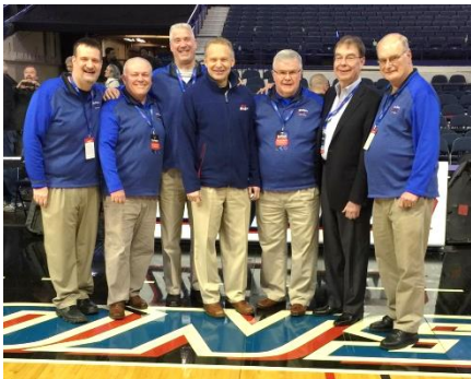
LAST DANCE (above): The Scorer's Table crew takes one last picture at the last game played at the Allstate Arena in March