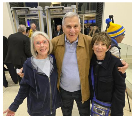
ON THE GO: Honorary Hoop Historian Jim Harrick (middle) really gets around. He is with two of the Bruins best boosters at Pauley Pavillion.