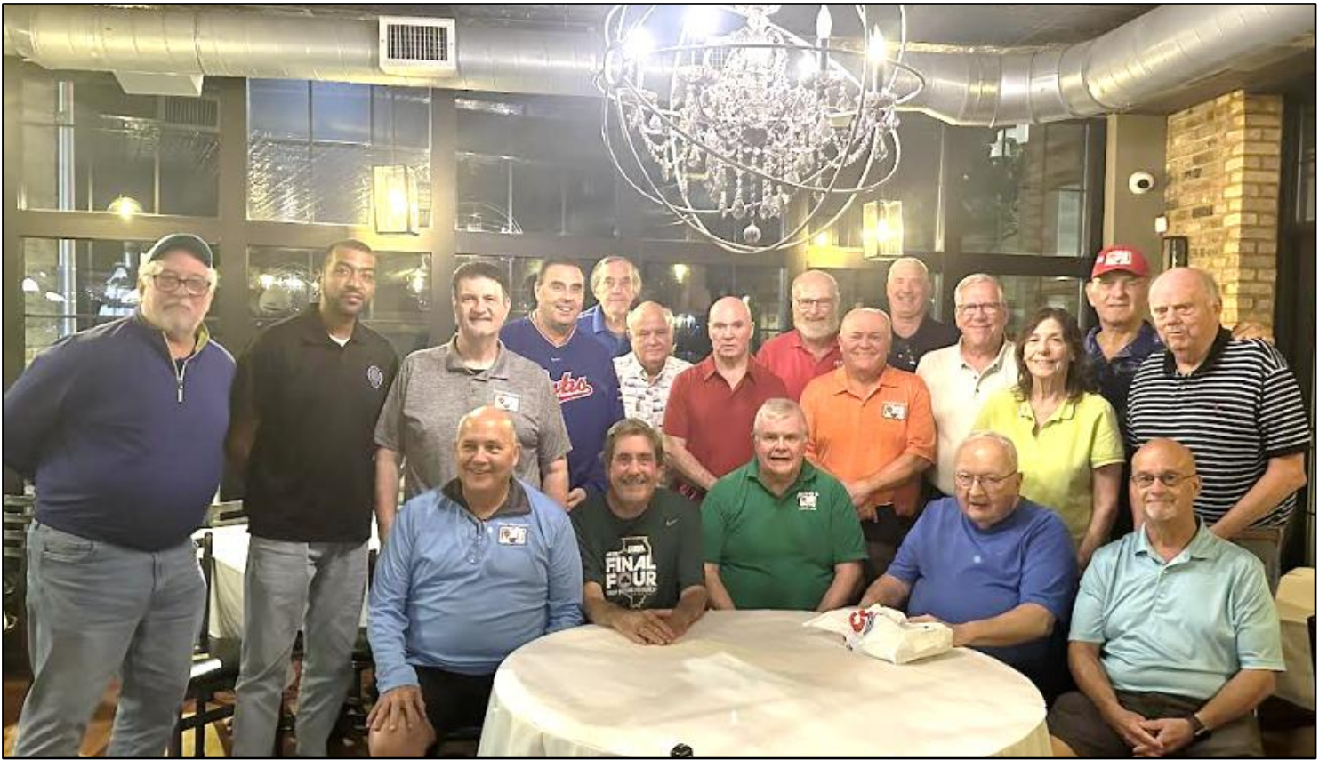
The third annual Hoop Historians Midwest Social Event was another success. The two Jeopardy teams had to go to a tiebreaker question to determine this year's champion. Thank you to all that participated.