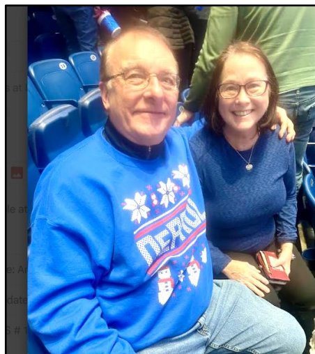
Happy Holidays from the Wintrust Arena.