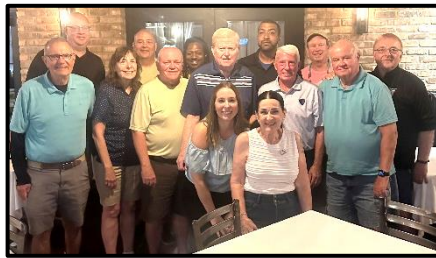
WE ARE THE CHAMPIONS: The highly contested Hoop Historians Jeopardy Challenge went down to the last question at the Midwest Social gathering. Congratulations to this year's winning team.