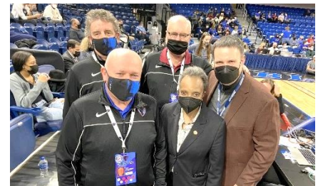
MEET THE MAYOR: DePaul Scorer's Table members take time out to pose with Chicago Mayor Lori Lightfoot before a recent game at Wintrust Arena.