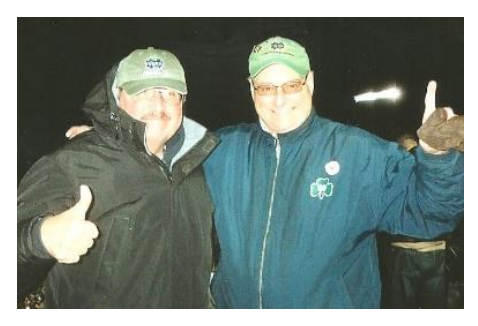
GO IRISH: Bruce spent many a day (and night) in South Bend watching Notre Dame football.