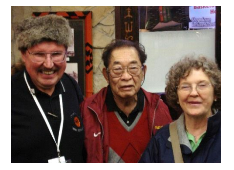
Final Fours in San Antonio would not be complete without Bruce's rendition of "The Ballad of Davy Crockett" outside the Alamo.